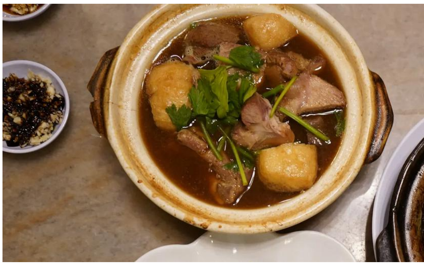
Bak Kut Teh