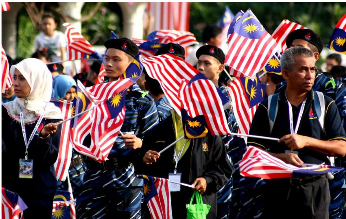
Hari Merdeka Celebration

An integrated hill resort development comprising of hotels, shopping malls, theme parks and casinos perched on the peak of Mount Ulu Kali remains a popular tourist destination.