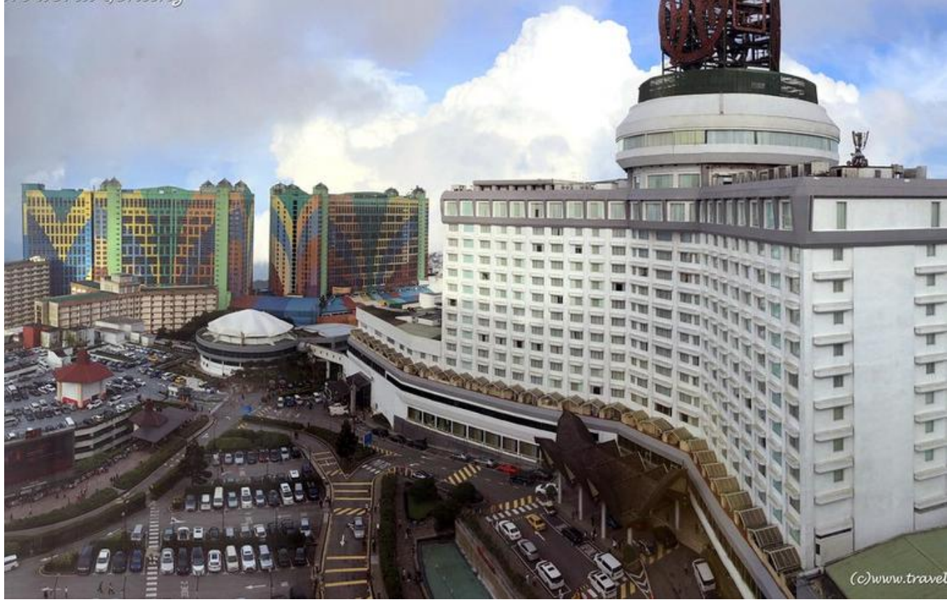
Resorts World Genting