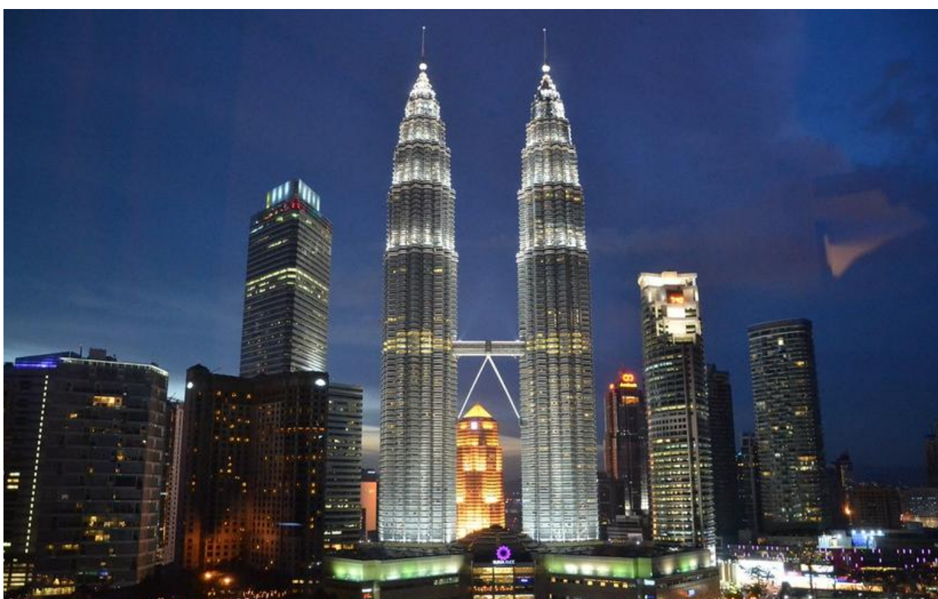
Petronas Twin Towers

A popular spicy noodle soup with Malay and Chinese influences. Different regions feature variations of this dish, such as Assam laksa in Penang, where the broth is tamarind-based and filled with noodles, cucumber, pineapple and lemongrass.