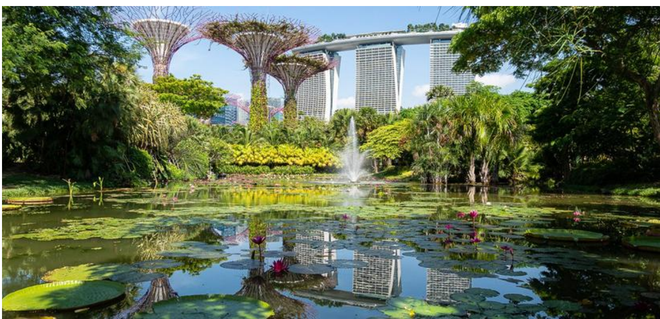
Gardens By The Bay

Built with the aim of raising the quality of life by enhancing greenery and flora, the nature park consists of 3 waterfront gardens, one of which houses the Flower Dome, the largest glass greenhouse in the world.