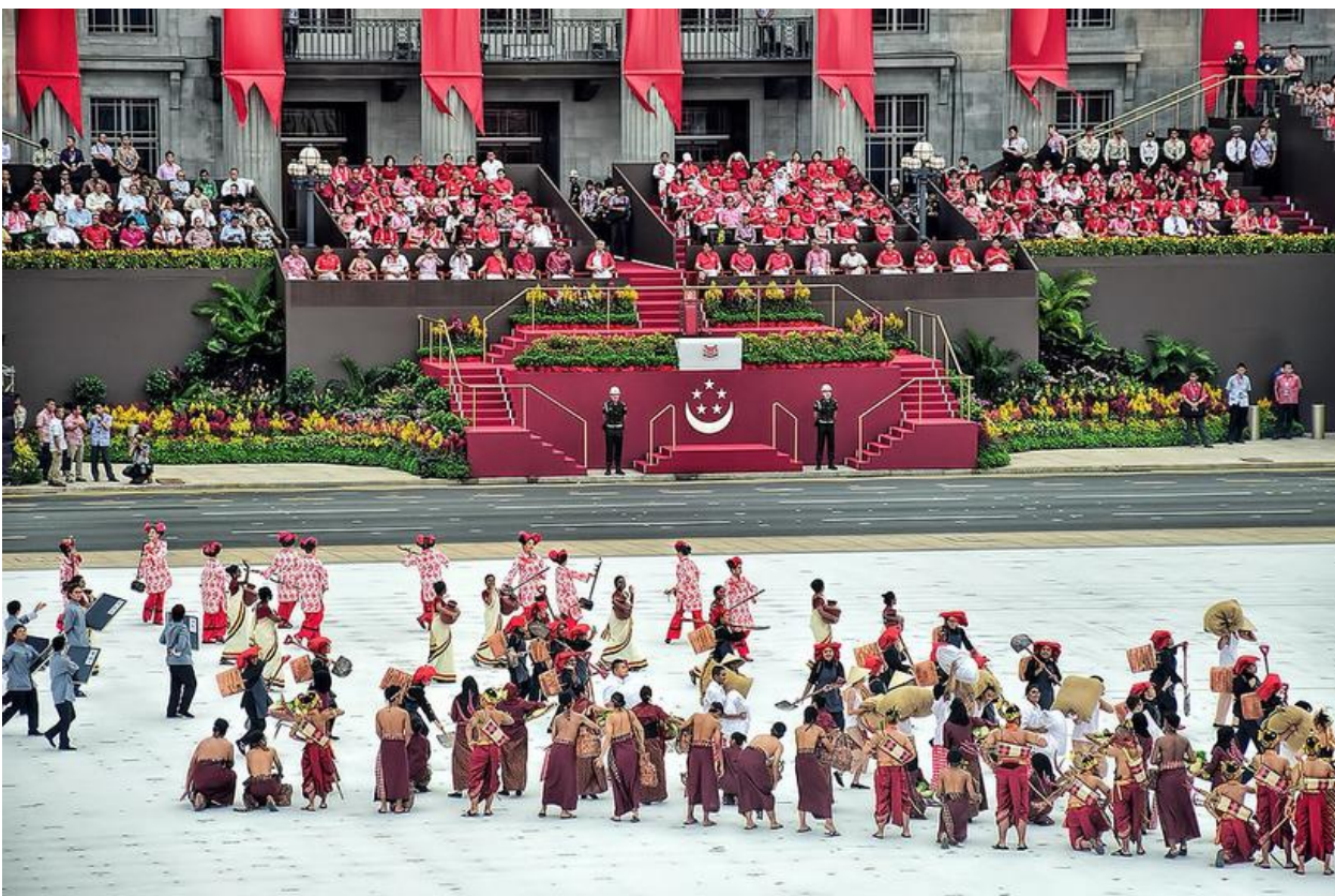
National Day Celebration

The annual celebration of Singapore's independence from Malaysia on 9 August 1965. Celebratory activities include the National Day Parade and fireworks displays.